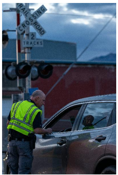
UTA Police Department educating drivers about rail safety during Utah Rail Safety Week.