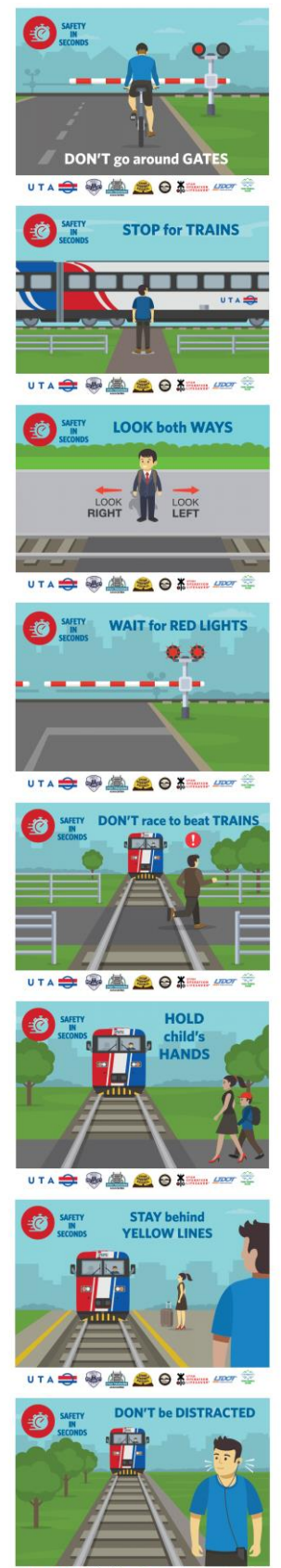
U T A 😂 🐵 🚈 🧟 🛛 🚛 🛲 🛱

VIDEO: Shocking close calls with Utah trains shared during safety week (fox13now.com)