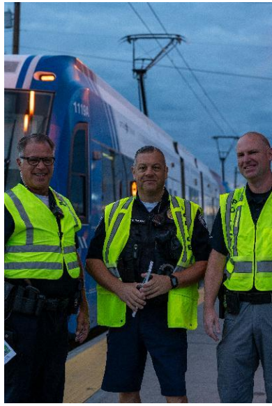
UTA Police Department handing out rail safety information on the platform.